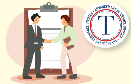
Tucker Advanced Life Insurance