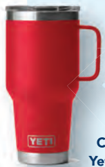
Custom Yeti Mugs