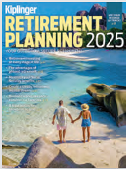
Kiplinger's Magazine "As Seen In" Exposure