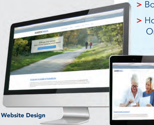
Custom Website Design