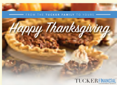
Holiday Pie Giveaway Event