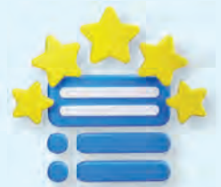
Get More Online Reviews