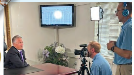
Showcase Video and Retire Happy Hour Production Opportunities