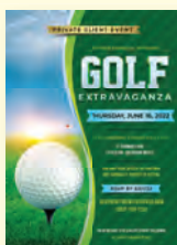
Intimate Client Appreciation Golf Outing

* Ask about our Client Appreciation Guide