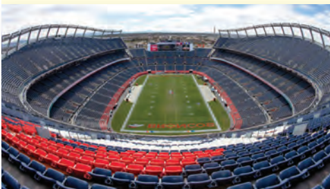
2023 Super Conference Empower Field, Home of the Broncos