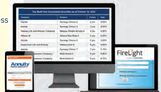
Latest Software & Rates